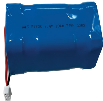
Figure 2. Battery

When battery icon is red, it needs to be charged. Use only the power supply that was received with the system. Plug the power cord into the front of the system (See " Figure 2. Battery ") and charge for 6 to 8 hours.