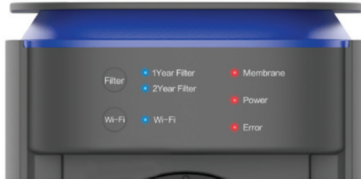
Figure 1. Smart RO unit LED indicators